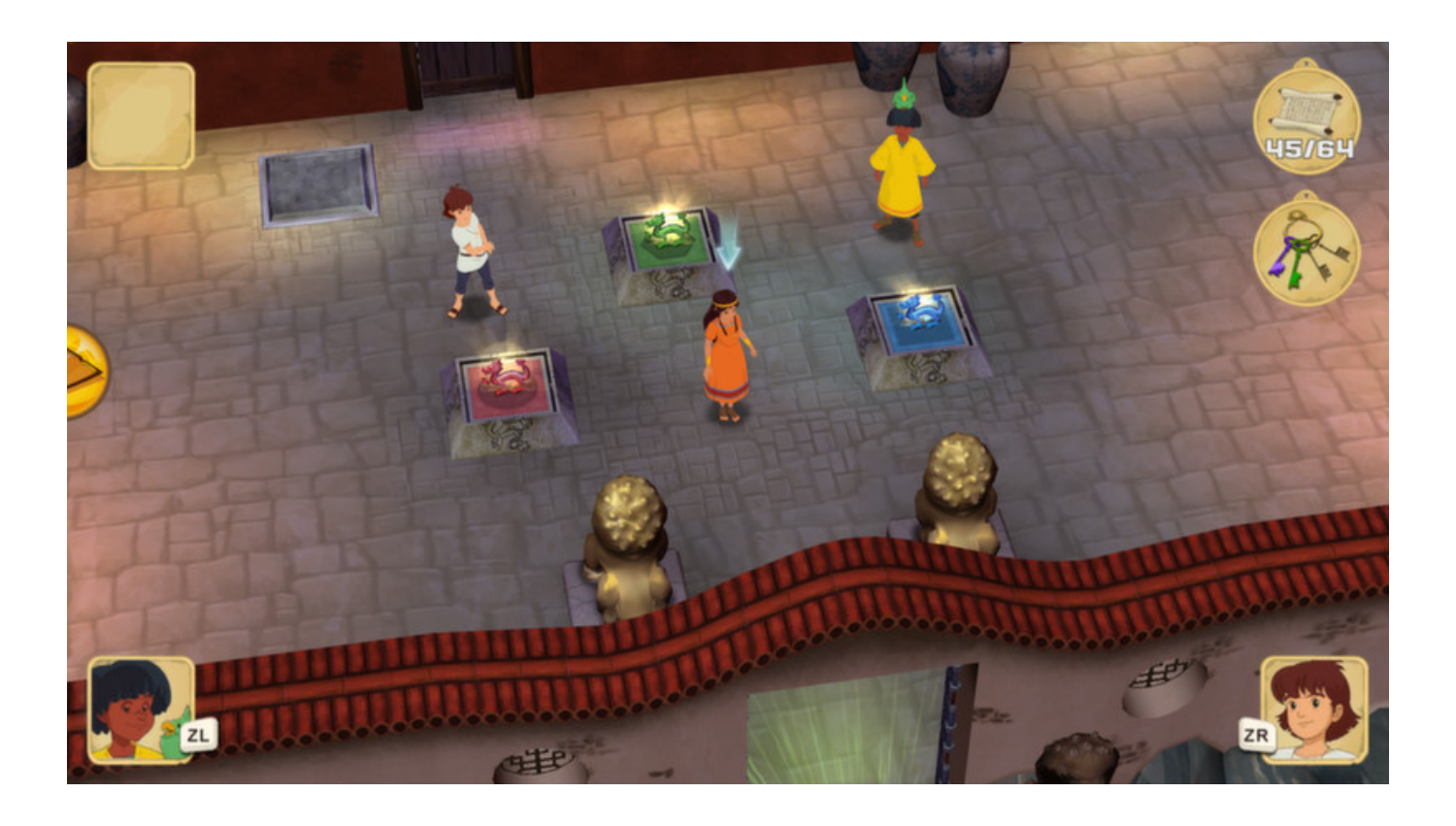
The Mysterious Cities Of Gold Activation Code

Download ->>->> <a href="http://bit.ly/2SLBjZl">http://bit.ly/2SLBjZl</a>